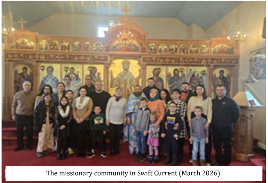
The missionary community in Swift Current (March 2026).

The second centre of missionary work is in Swift Current, approximately 250 km from Regina. Regular services began here in the summer of 2025.