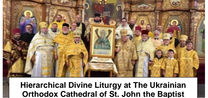
Hierarchical Divine Liturgy at The Ukrainian Orthodox Cathedral of St. John the Baptist October 28, 2018