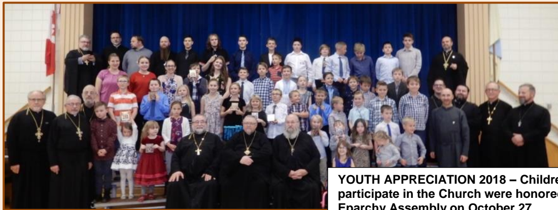
YOUTH APPRECIATION 2018 – Children and youth who participate in the Church were honored at the Western Eparchy Assembly on October 27.