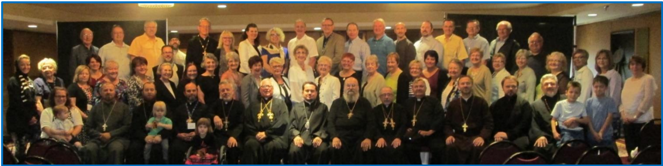
DELEGATES FROM THE WESTERN EPARCHY AT THE UOCC SOBOR, July, 2015