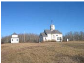
All Saints, Bellis, AB.

Under the section—“Search” there is photo display of our UOCC parishes, providing a digital photo had been sent to the Consistory. For example: