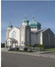
All Saints Kamloops, BC