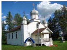
Holy Transfiguration Grassland, AB