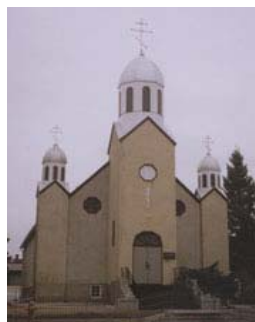
Holy Trinity Lethbridge, AB