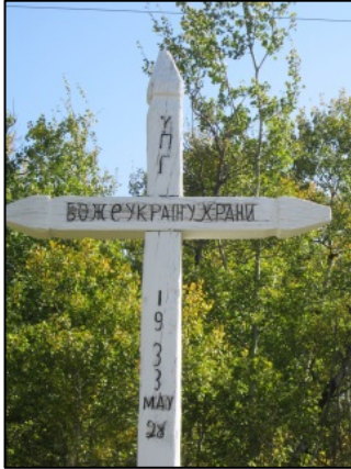
Original hand made cross dated May 28, 1933. Located by the Ukrainian Orthodox Church of All Saints, BELLIS, ALBERTA

We call to mind those who were too long forgotten – many of them relatives, neighbors, co-workers and friends of a significant number of people still alive today. In spite of the fact that the government of the former Soviet Union and those of other nations in the world deliberately attempted – and in some cases still do today – to eradicate the memory of this horrific disaster from historical annals – we again make the promise that we will NEVER forget. We will NOT allow their martyrdom to go without meaning. We WILL remind the world's political leaders that they no longer have unlimited and unquestioned power to destroy life. We WILL remind mankind of the sanctity of life and the God-given rights of every individual human being. We call to mind the words of Edmund Burke: "Those who don't know (or ignore – George Santayana) history are destined (condemned) to repeat it."